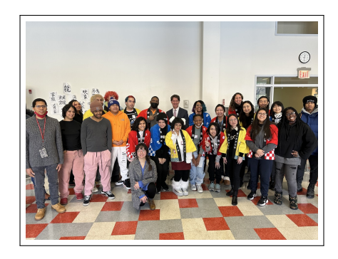
Student Clubs Spring Fest -March 27, 2024

On January 17, 2024, the Japan and Entertainment Club held a New Year Celebrations event at Poolside Cafe. The celebration showcased diverse East Asian traditions from Japan, China, and Korea, including calligraphy, mochi-pounding, and a lion dance. Attendees enjoyed food samples like sushi and sweet rice cake, experiencing a true cultural immersion.